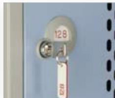
Key cam lock

Comprehensive brochure available on request